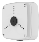
PFA122 Junction box